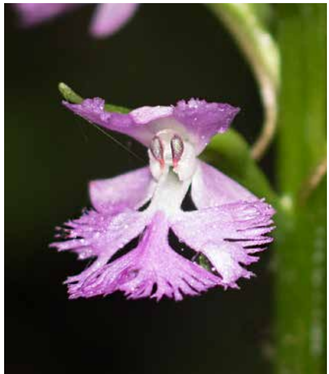
Figure 1. Lesser purple fringed orchid ( Platanthera psycodes ) from Smithtown, Suffolk County, NY. Left: inflorescence; right: close-up of a flower, note the two ripe pollen sacs (pollinia) at the base of the lip. Photos by Taylor Sturm, 2023.

On April 22, 2023, I spent my morning looking for goldenclub ( Orontium aquaticum ) in the Town of Smithtown, Suffolk County. In my pursuits, I traipsed into an obscure, unnamed wetland within the headwaters of the Nissequogue River. There, a convergence of numerous groundwater seeps trickle through an Acer and Nyssa -dominated swamp and feed the river. I did not find any goldenclub that day, but I did notice at least a dozen Platanthera orchids (I did not keep count) in early-spring growth, just emerging from the mossy edges of the water.