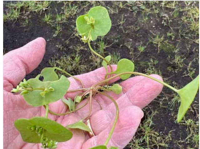
Figure 1. Claytonia perfoliata (miner's lettuce) from Suffolk County, NY.

New record for New York. Claytonia perfoliata is reported here as the first naturalized occurrence in New York; it has not previously been reported for the state (Miller and Chambers 2006, Werier 2017, Werier et al. 2023, USDA 2023). This spring, at an agricultural tree farm in eastern Southampton Township a small population (3 individuals) of C. perfoliata was discovered growing in a production area under some benches in a hoop house topped with mesh shade cloth and open sides to the elements. Voucher: New York, Suffolk Co., Southampton Township, growing at an agricultural tree farm, 18 May 2023, V. Bustamante 2097 (NY). This species, with its bizarre upper leaves, is native to western North America, Mexico, and Central America where it prefers shady, moist habitats. It is introduced in the eastern United States, South America, Europe, Asia, (continued on next page)