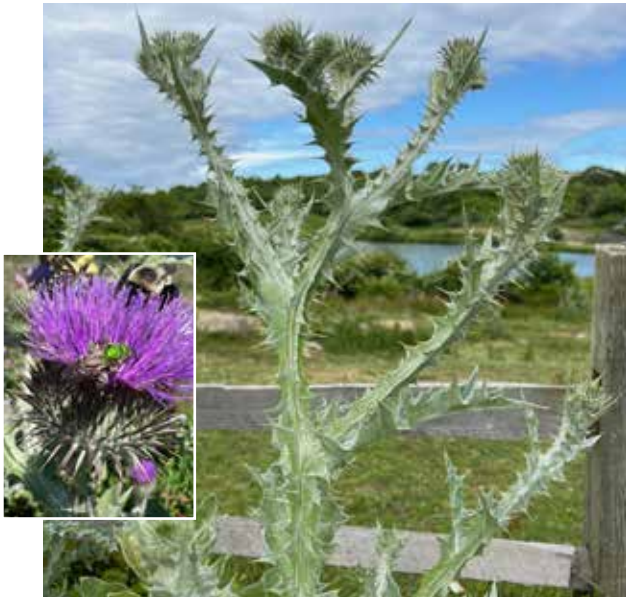
Figure 2. Onopordum acanthium subsp. acanthium (Scotch thistle) from Suffolk County, NY. Inflorescence, winged upper stem, and close-up of a flower (inset) with insect visitor. Photos by Victoria Bustamante, 2022

(Noteworthy Plants, continued from page 25)