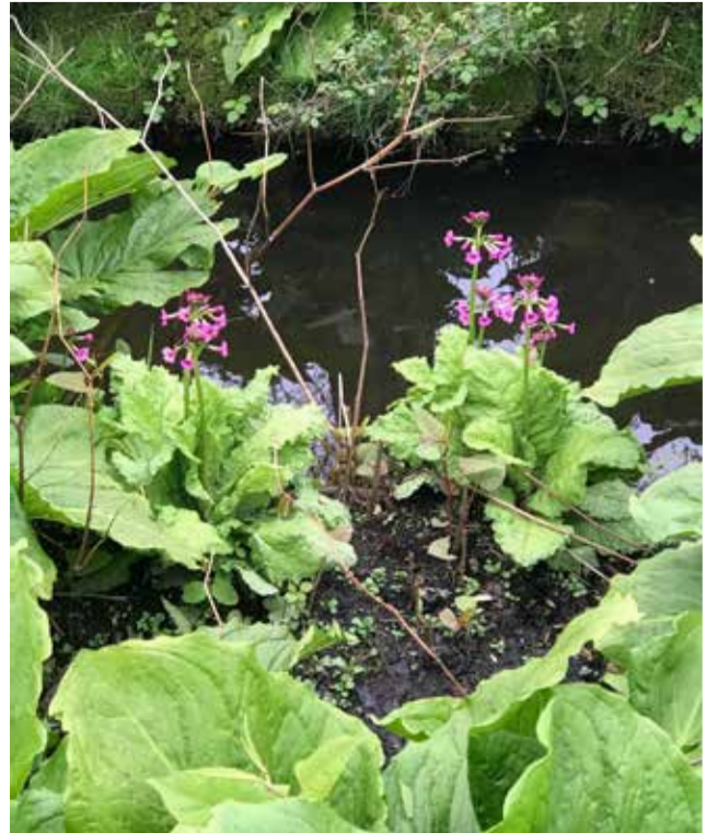
Figure 5. Primula japonica (Japanese primrose) from Suffolk County, NY. Photo by Victoria Bustamante, 2019.

New record for New York. Voucher (determined by Harvey Ballard): New York. Suffolk Co., Southampton Township, 100 Majors Path, tree farm agricultural weed (40.89992N, 072.394362W), 23 Apr 2020, V. Bustamante 1650 (NY).