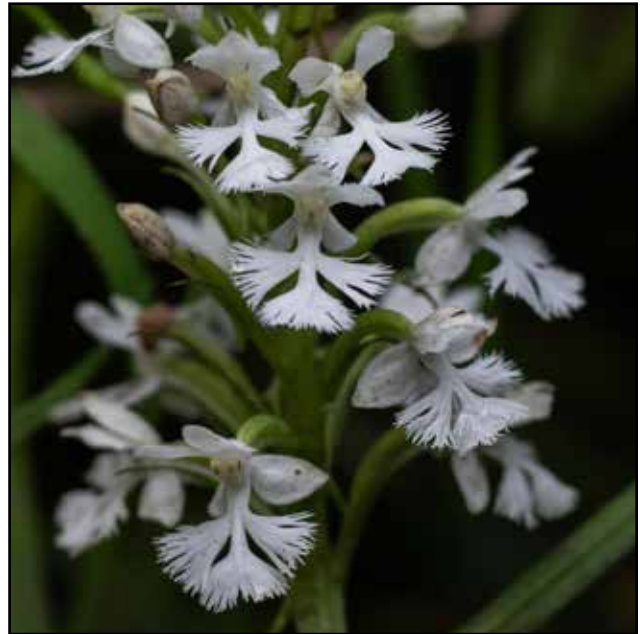
Figure 2. Within a colony of Platanthera psycodes one is likely to encounter flowers of every shade of color from white (forma albiflora , above) to bi-colored, to deep purple. Photo by Taylor Sturm, 2023.

After thoroughly documenting this new population through photography (to rule out the similar-looking P. grandiflora and hybrid Platanthera taxa), I revisited the site once more on July 14, this time with Dave Taft. The main purpose of this visit was, in part, to get an understanding of the size of this new population. After over two hours of searching, we came up with an impressive 186 individuals: 94 flowering plants (or attempting to flower) and 92 sterile leaves. Also of note were at least two individuals with flowers that were entirely white; an uncommon color morph known as Platanthera psycodes forma albiflora (Brown and Folsom 1997, Fig. 2).