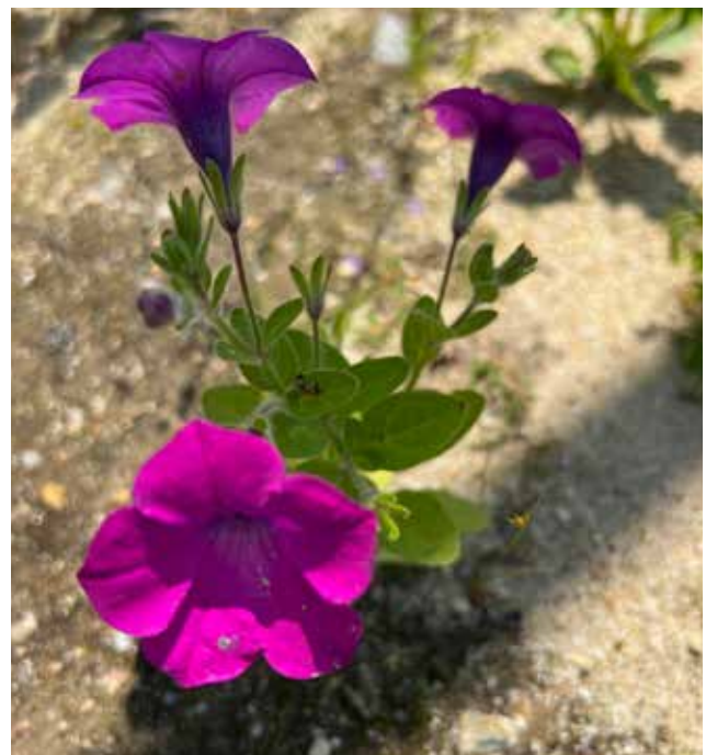
Figure 4. Petunia integrifolia (violet petunia) from Suffolk County, NY.

Petunia integrifolia , violet petunia (Solanaceae, the Potato Family). Non-native. (Fig. 4).