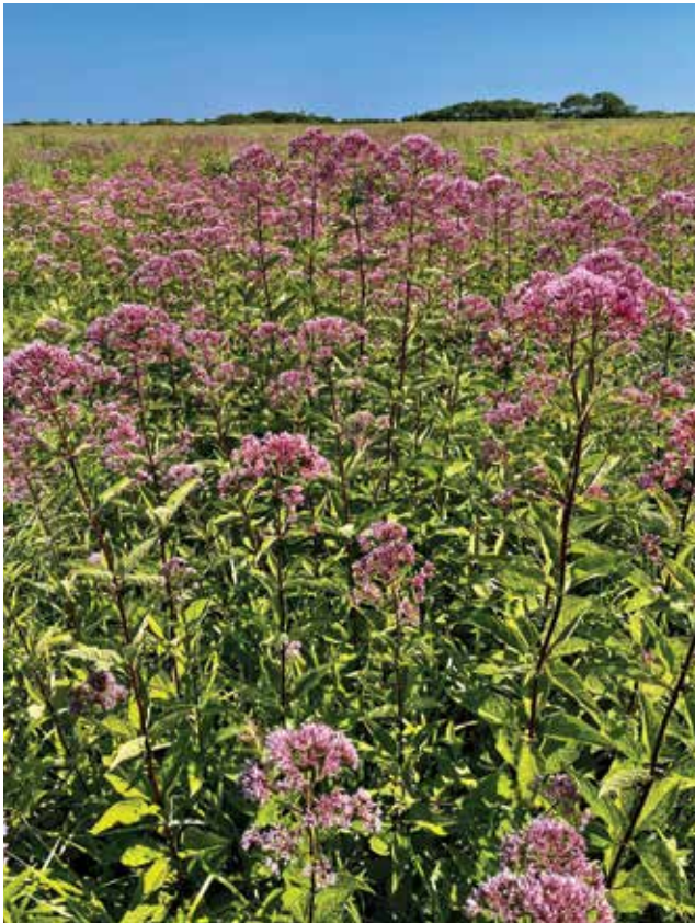
Figure 3. Coastal plain Joe Pye weed ( Eutrochium dubium ) in a maritime grassland on Fishers island, New York. Joe Pye was an American Indian known for his special skill as a medicine man who made the rounds of rural New England in the late 1700s. He apparently was specially skilled at reducing fevers. One of the few records of him show that he bought "1 qt rum, 1 s[hilling] 6 p[ence]" at a tavern in Stockbridge, Mass., in 1775, so perhaps he made an elixir as well as an herb infusion. Photo by Steve Young, 2021.

Here are some of the rare species that I saw during the two weeks that I was on the island. Unlike the beaches of the South Shore of Long Island, the beaches of Fishers Island are composed of larger cobbles and boulders and are fairly difficult to walk on, so you rarely see people on them. In the past they had supported the most occurrences of the very rare Angelica lucida (seacoast angelica), but this plant was not seen at all during our surveys in 2021. One rare plant that was common on the beaches was Chenopodium berlandieri var. macrocalycium (large calyx goosefoot, Fig. 2) and Fishers Island has the most plants of any location