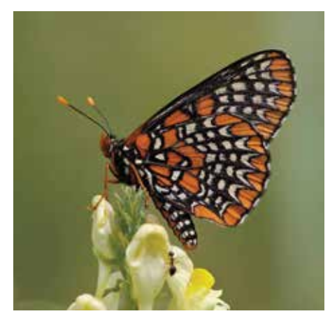
Baltimore Checkerspot at Caumsett.