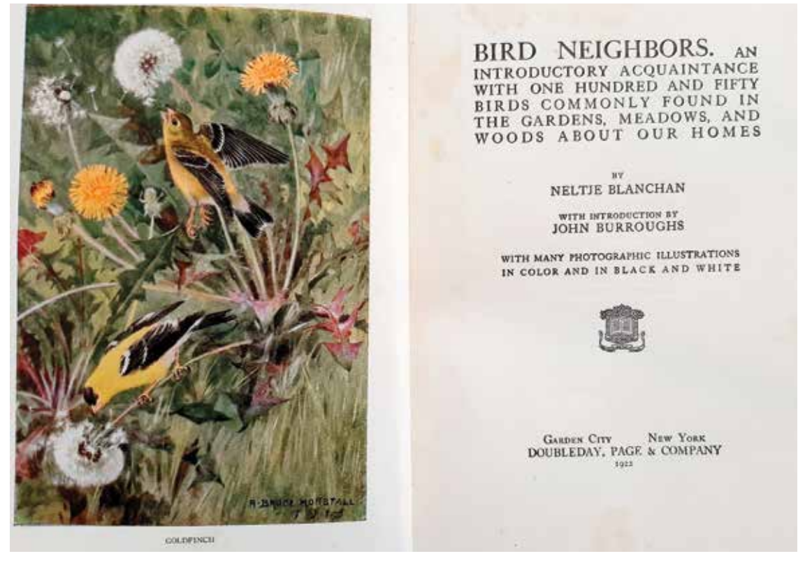
Figure 8. Bird Neighbors by Neltje Blanchan, title page and illustration. This was the first nature book written by Neltje Blanchan Doubleday. Intended for a broad audience, with color illustrations and clear language, it was immensely popular. Her other books include Birds that Hunt and Are Hunted, Nature's Garden , and The American Flower Garden .

Would TR have approved of her descriptive narratives? He was not impressed by some of the anthropomorphized animal stories of the time (see Addendum) – he and naturalist John Burroughs came out publicly against what they termed the