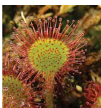
Figure 13. As noted on page 6 of this article, Neltje Blanchan described round-leaved sundew ( Drosera rotundifolia ) as "a bloodthirsty little miscreant" with "tentacles, reaching inward to imprison [its prey] within their slowly closing embrace. Death alone releases him." Images from Bing.com/images.