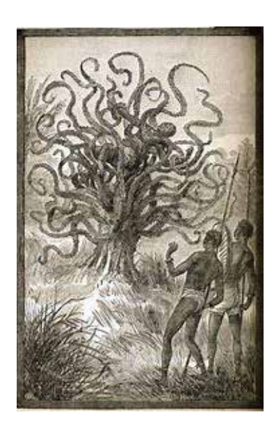
Figure 12. During Theodore Roosevelt's time, natural history books often romanticized and exalted nature, but sometimes plants and animals were portrayed as menacing or threatening in a sinister way.