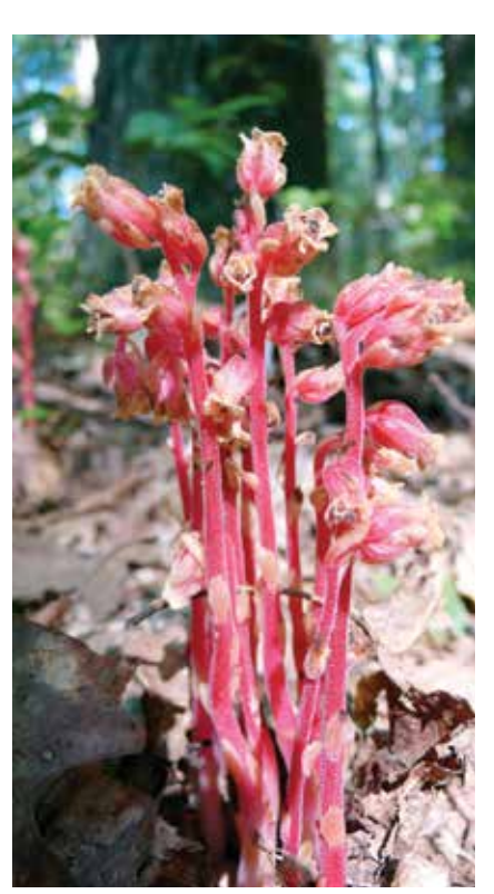
Figure 4. Red pinesap ( Hypopitys lanuginosa ). Pinesaps are mycotrophs, receiving nutrients via fungal mycelia rather than through photosynthesis. Image from Go Botany (gobotany.nativeplanttrust.org).

New record for Long Island. Before this report, Amur privet was known in New York from only one old specimen, but data associated with that specimen indicate it may be naturalized (Werier 2017). Further evidence of Amur privet being naturalized in New York is based on Vicki Bustamante's collection from a spontaneously occurring individual along a trail in Montauk County Park, Suffolk Co. [voucher: 22 Jun 2018, V. Bustamante 1299 (NY)]. The collection was determined by David Werier. Species growing with Amur privet at this site include coastal shadbush (Amelanchier canadensis var. canadensis), wild black cherry (Prunus serotina var. serotina), northern dewberry (Rubus flagellaris), multiflora rose (Rosa multiflora), common greenbrier (Smilax rotundifolia), and southern arrowwood (Viburnum dentatum var. venosum). Amur privet is native of Japan.