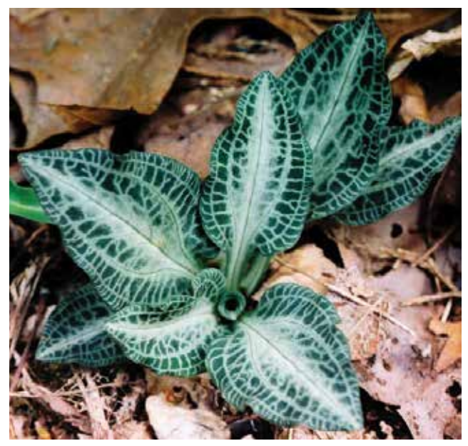
Figure 3. Basal leaves of downy rattlesnake plantain ( Goodyera pubescens ). The attractively reticulated, evergreen leaves of this orchid are a visual treat in any season.

Rare plant in New York (state rank: S1). This diminutive annual herb is at the northern limit of its range in southeastern New York where it has been rare but stable, with about the same number of populations, for the last 100 years. Historically, in New York it occurred only on Staten Island, Long Island, and Bronx and Westchester counties. Currently, there are 10 known populations in New York, all in Suffolk Co.; only three of the 10 populations have more than 200 individuals. There are three historical populations from the early 1900s that have not been resurveyed. In August 2018, Vicki Bustamante found a population of clustered bluets in a wet, sandy opening near the shoreline of Big Reed Pond, Montauk County Park, East Hampton Township, Suffolk Co. [voucher: 11 Aug 2018, V. Bustamante 1366 (NY)]. Species growing with E. uniflora at this site include autumn fimbry ( Fimbristy lis autumnalis), grass-leaved rush (Juncus marginatus), slender yellow-eyed grass (Xyris torta), cross-leaved milkwort (Polygala cruciata), and brownish beak sedge (Rhynchospora capitellata). This species has been placed in three different genera during the past 30 years: Hedyotis (Gleason and Cronquist 1991), Oldenlandia (Werier 2017), and Edrastima (Weldy et al. 2020).