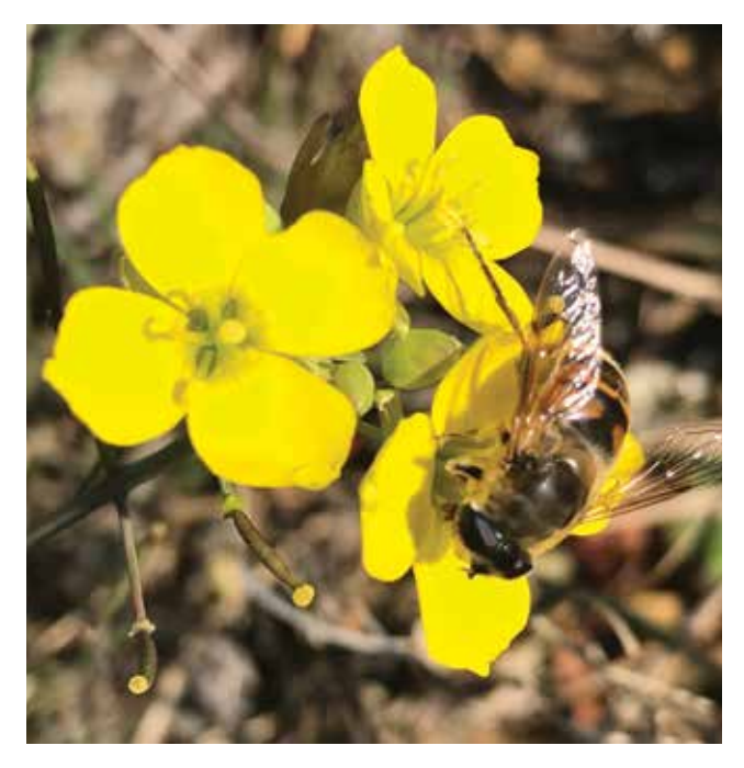
Figure 2. Sand rocket ( Diplotaxis muralis ) from Towd Point, Southampton Township, with mature flowers and developing fruits (siliques). The insect visitor, identified by Daniel Gilrein as a female drone fly ( Eristalis tenax ), was introduced from Europe around 1875 and is a mimic of the European honey bee ( Apis mellifera ). This type of mimicry is called Batesian mimicry because the mimic (not dangerous to predators) benefits because most predators avoid bees and wasps because they can inject toxins by stinging, so predators also avoid drone flies that are mistaken for bees and wasps. Photo by Vicki Bustamante, 2018.

Rare plant in New York (state rank: S2S3). In June 2019, Vicki Bustamante found a population of C. hormathodes in a marsh on the west edge of Oyster Pond behind the dunes of Block Island Sound, Montauk State Park, Suffolk Co. [voucher: 9 June 2019, V. Bustamante 1512 (NY)]. Species growing with C. hormathodes at this site include blue flag ( Iris versicolor ), common winterberry ( Ilex verticillata ), sallow sedge ( Carex lurida ), woolly sedge ( C. pellita ), common soft rush ( Juncus effusus ssp. solutus ), and swamp rose mallow ( Hibiscus moscheutos subsp. moscheutos ). Carex hormathodes occurs in brackish marshes and other maritime areas on rocks and sand often within reach of salt spray. There are 20 known populations of marsh straw sedge in New York and more than 20