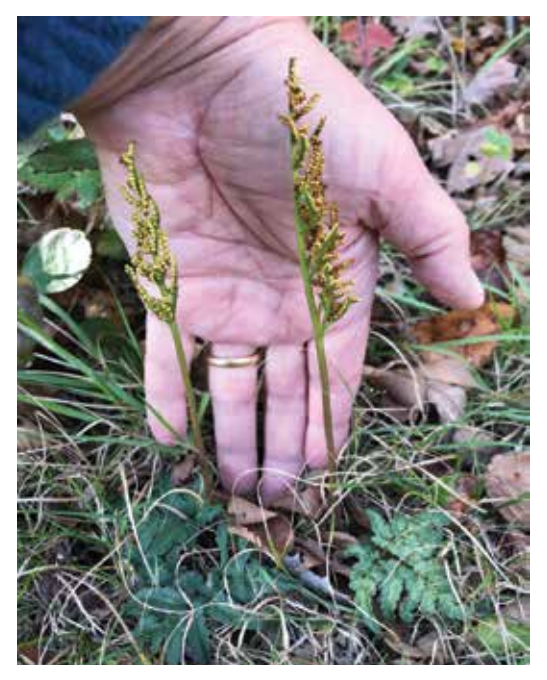
Figure 1. Blunt-lobed grape fern ( Botrychium oneidense ) at Montauk, Long Island.

New record for Long Island. For the past 100 years, this nonnative annual grass from southeastern Asia has been spreading throughout eastern USA where it is invasive. Within three to five years it can form dense monotypic stands that crowd out and eliminate native, herbaceous vegetation. Arthraxon hispidus was reported from Bronx Co., New York as early as 1950 (Fernald 1950) and in 1990 it was still known in New