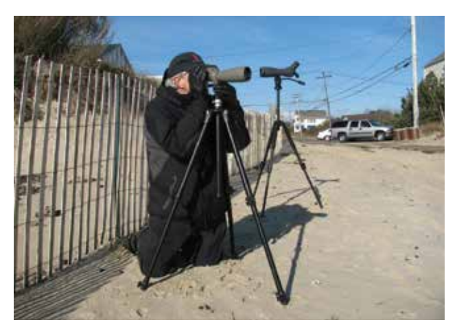
"Old habits die hard."