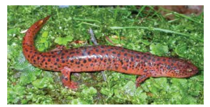
Northern Red Salamander, Sussex Co., NJ.