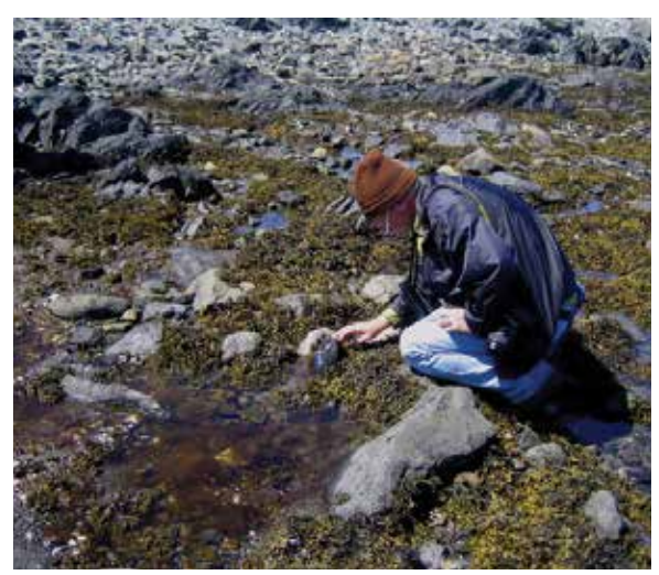
Rich in familiar pose investigating what's out there living and growing, from the LIBS Newfoundland trip in 2006. Photo by Kristine Wallstrom, July 11, 2006.