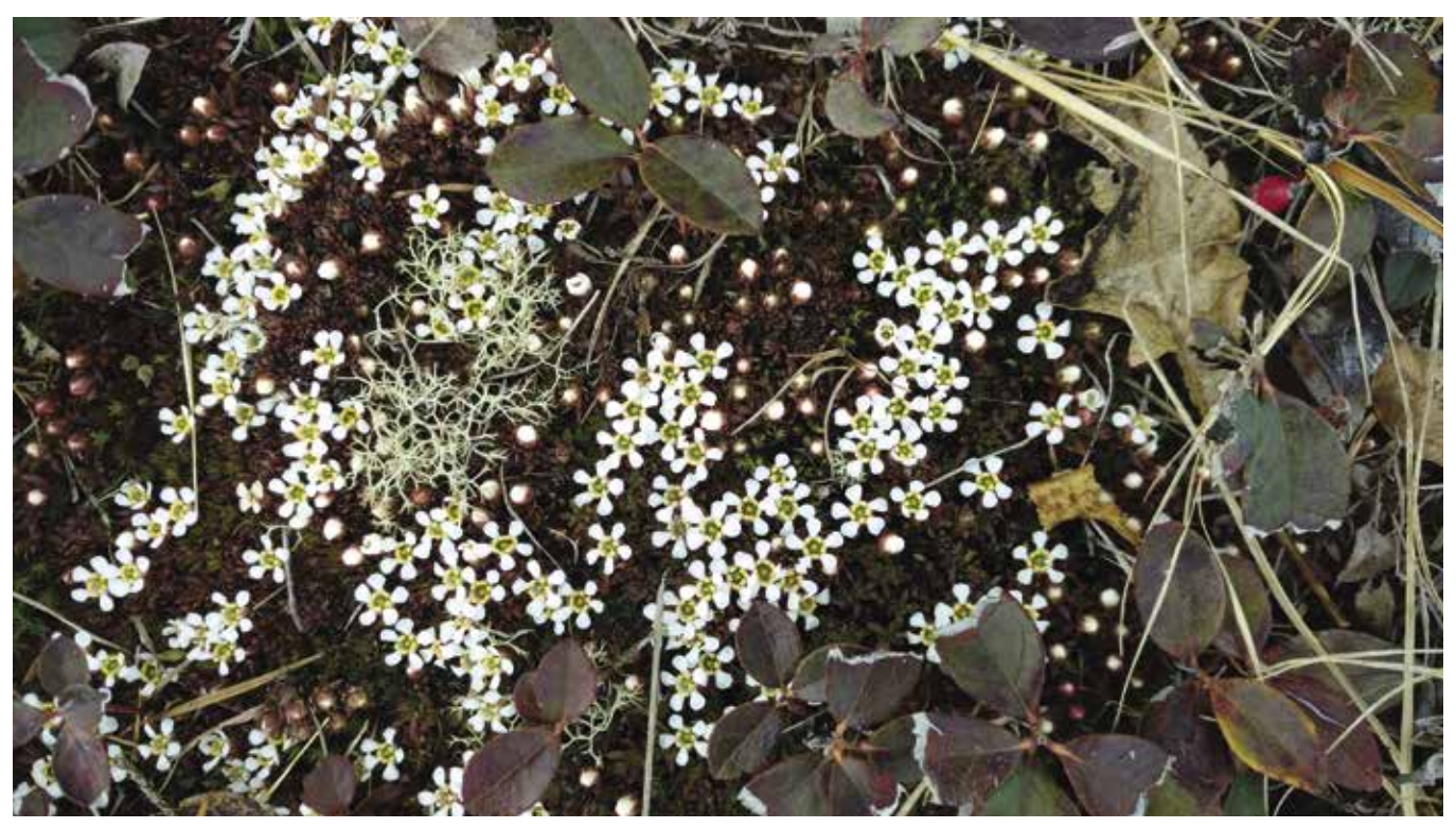
Figure 1. From bare soil to a complex ecological community in 22 years. This 2017 photo reveals the high plant diversity at the Freeman Avenue site. Pyxies have delicate white flowers and moss-like evergreen leaves. Interspersed among the pyxies (left of center) is a "reindeer lichen" known as Cladonia subtenuis. Encircling the pyxies is a ring of wintergreen (aka teaberry) plants ( Gaultheria procumbens), one with a red fruit. Dried needles of pitch pine ( Pinus rigida) and dried oak ( Quercus spp.) leaves decay and enrich the soil.

<sup>1</sup>Chief Botanist, NY Natural Heritage Program, <sup>2</sup>Co-Chair, LIBS Conservation Committee