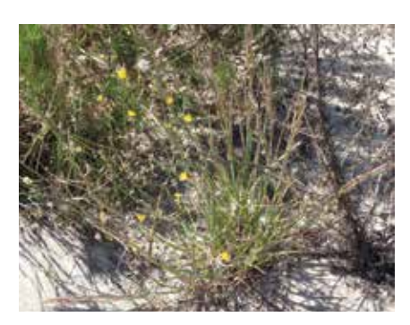
Figure 5. Chondrilla juncea (skeleton-weed), Jones Beach.

Chondrilla juncea , skeleton-weed (not native) Asteraceae, the Aster Family