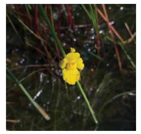
Figure 11. Utricularia striata (striped bladderwort) Sandpit Ponds, Calverton.

Utricularia striata , striped bladderwort (native, S2) Lentibulariaceae, the Bladderwort Family