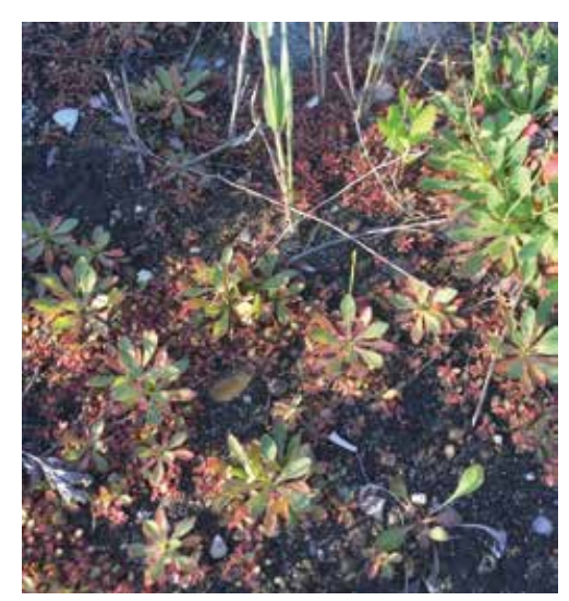
Figure 9. Limonium sp. (sea lavender) rosettes.

Limonium latifolium. Daniel Atha at NYBG studied a collection by Victoria Bustamante and noted: "The Limonium specimen ( Bustamante 1073 ) may be Limonium binervosum. The habit, leaves and inflorescences look reasonable, but there are so many species, it's hard to be sure." Efforts to eradicate the population began in 2017. This species needs to be identified and monitored at Three Mile Harbor.