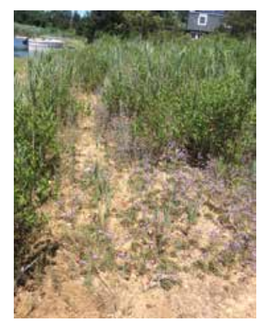
Figure 8. Limonium sp. (sea lavender).

Limonium sp., sea lavender (not native) Plumbaginaceae, the Leadwort Family