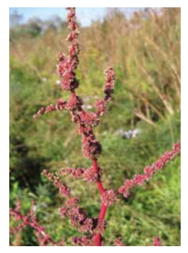
Figure 1. Amaranthus spinosus (spiny amaranth) at Montauk.

Amaranthus spinosus, spiny amaranth (not native) Amaranthaceae, the Amaranth Family