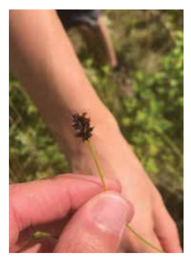
Figure 4. Carex mesochorea (midland sedge).

Carex mesochorea , midland sedge (native, S2) Cyperaceae, the Sedge Family