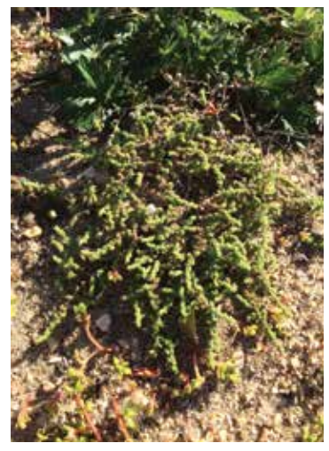
Figure 7. Herniaria hirsuta subsp. cinerea (hairy rupturewort).

(not native) Caryophyllaceae, the Pink Family