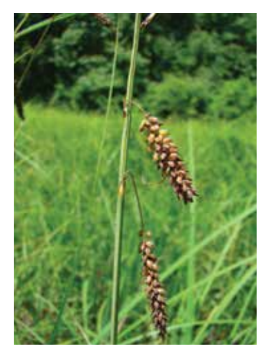
Figure 3. Carex barrattii (Barratt's sedge).

(Noteworthy Plants, continued from cover)