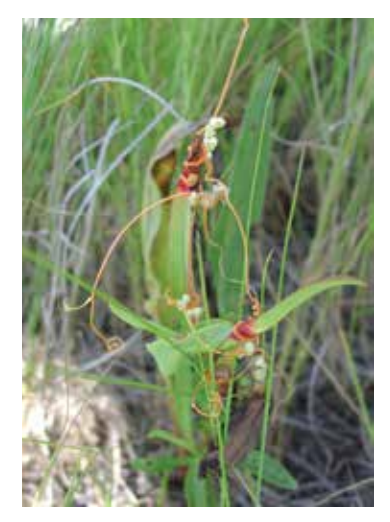
Figure 6. Cuscuta obtusiflora subsp. glandulosa (southern dodder).

Convolvulaceae, the Morning-glory Family