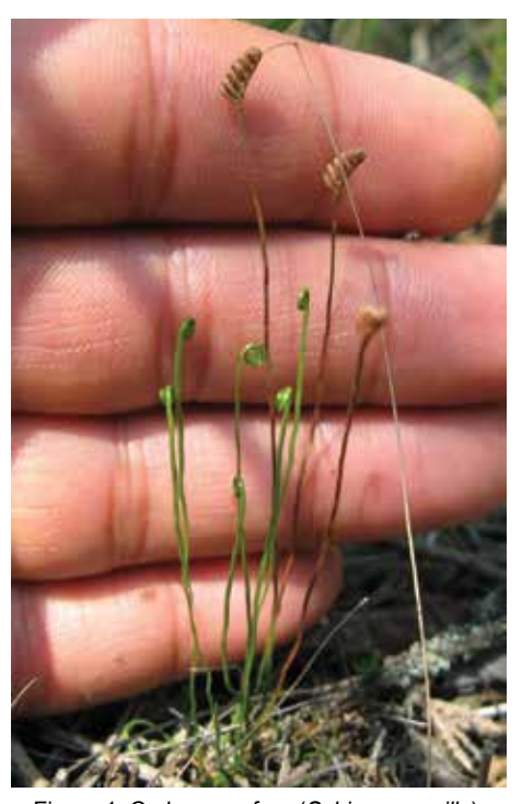
Figure 1. Curly-grass fern ( Schizaea pusilla ) from the New Jersey pine barrens. Ed. Note: This is the plant depicted in the LIBS logo, above.

What is a naturalist? you might ask. This word has nearly disappeared from the scientific community and everyday life.