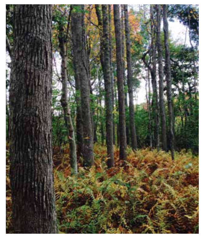
Figure 5. Habitat where we searched for Dryopteris and Botrychium, southwest side of Big Reed Pond in Montauk.

(One Day in the Life... continued from page 13)