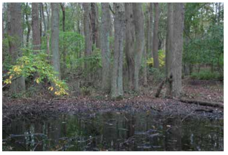
Figure 2. A red maple-black gum swamp showing an intermittent pond dominated by tupelo (black gum) along the edge.

Two different types of forest border the skunk cabbage