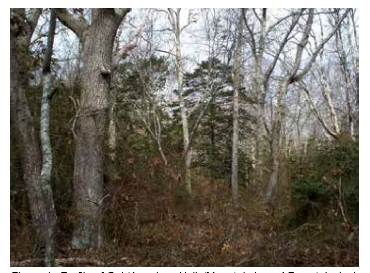
Figure 1. Profile of Oak/American Holly/Mountain Laurel Forest, typical of the Point Woods, Montauk. Left: Quercus sp.trees; center and right: llex opaca; Smilax understory (leafless); ?Kalmia latifolia behind Quercus specimens. Photo by AMG, March 28, 2012.

The Montaukett Native Americans occupied Point Woods during pre-colonial and colonial history. English colonists grazed sheep on the "Montauk Downs" and may have cut wood from the forest. Taylor (1923) described a pastoral landscape in which woody