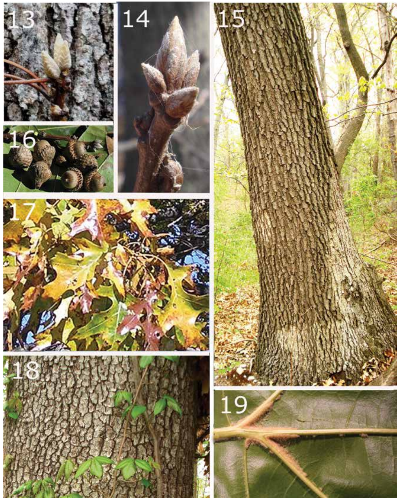
Plate III. Quercus velutina from Long Island, N.Y.