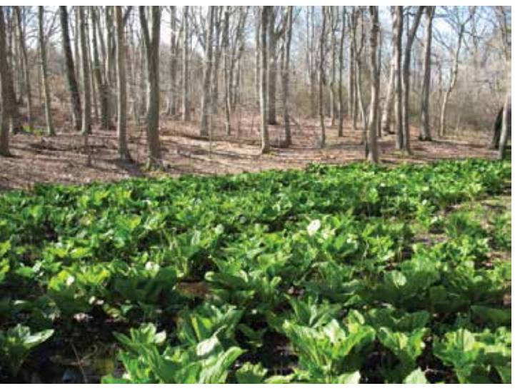
Figure 1. The giant green leaves of skunk cabbage explode into a lush, dense carpet of green covering only those areas with mucky sediments.

A close look into the wetland reveals other plants, including ferns ( Osmundastrum cinnamomeum , Thelypteris palustris , and Onoclea sensibilis ) and jewelweed ( Impatiens capensis ), emerging from winter sleep. By May 1<sup>st</sup>,