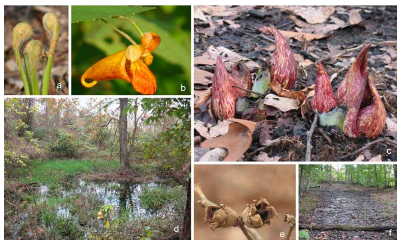
Figure 3. a. "Fiddle-heads" of cinnamon fern in April, b. Close-up of a jewelweed flower, c. Skunk cabbage flowers emerging from muck in February, d. Red maple-black gum swamp, e. Close-up of the woody fruits of witch-hazel ( Hamamelis virginiana ), a shrub in the understory of the coastal oak-beech forest, f. Coastal oak-beech forest: looking uphill at the source of water seeping down into the skunk cabbage wetland. [All photos taken at North Fork Preserve by E. Lamont.]

The swamps and forests at North Fork Preserve provide excellent habitat for many species of reptiles and amphibians, as well as birds of special concern. Populations of milk snake, green snake, black racer, ring-neck snake, garter snake, as well as box turtle, painted turtle, and snapping turtle, all live in this ecosystem. The swamps, marshes, and ponds, along with a wide forest border, provide critical habitat for populations of tree frog, wood frog, green frog, and spring peeper, all biological indicators of a healthy environment. The chorus of singing male frogs in the spring is a cacophony of croaks, peeps, and twangs. The old growth forest is among Long Island's most natural and wild regions. The preserve is located in the Township of Riverhead, on the north side of Sound Avenue, just east of Church Lane.