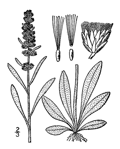
Gamochaeta purpurea (L.) Cabrera - spoonleaf purple everlasting Britton, N.L., and A. Brown. 1913. An illustrated flora of the northern United States, Canada and the British Possessions. Vol. 3: 456. Courtesy of Kentucky Native Plant Society. Scanned by Omnitek Inc.

Fallopia baldschuanica [=Polygonum aubertii]; Silver Lacevine, Russian Vine (Polygonaceae, the Buckwheat Family). Rich Kelly reported an established colony of this non-native species from Nassau County just south of Belmont Park Race Track where an intertwining mass of vines hangs over a fence bordering exit 26 on the Cross Island Parkway. In its native habitat in eastern Asia, F. baldschuanica often grows hanging over rock outcrops and cliffs. This species report is a new record for Long Island.