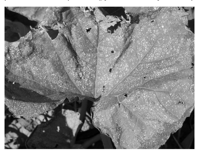
Figure 1. Pumpkin leaf affected by ground level ozone.

My colleagues and I have identified an alternative method for investigating ozone impact that entails comparing two lines or clones of a plant that differ in sensitivity to elevated ozone but have similar productivity when ozone levels are low. To date we have developed two systems--one with white clover and another with snap bean. For the clover system, plants are grown outdoors in pots. Impact of ozone on the productivity of the sensitive clover is estimated by cutting leaves off every four weeks and comparing the dry weight of leaves from the sensitive clover to that of the tolerant clover. The beans are grown outdoors in the ground. Both fresh market and mature yield are measured by removing pods from some plants every