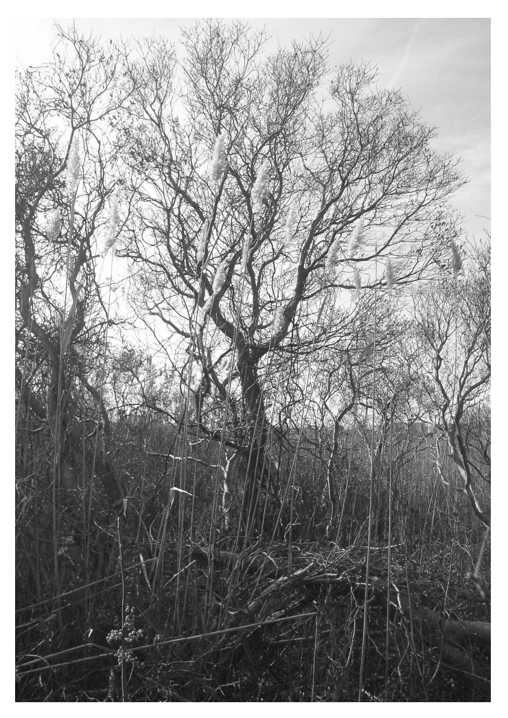
New York State Champion Northern Bayberry, Lido Beach Marine Conservation Area.

As we walked along the trail, I noticed what appeared to be some fairly tall shrubs with a good number of persistent leaves.