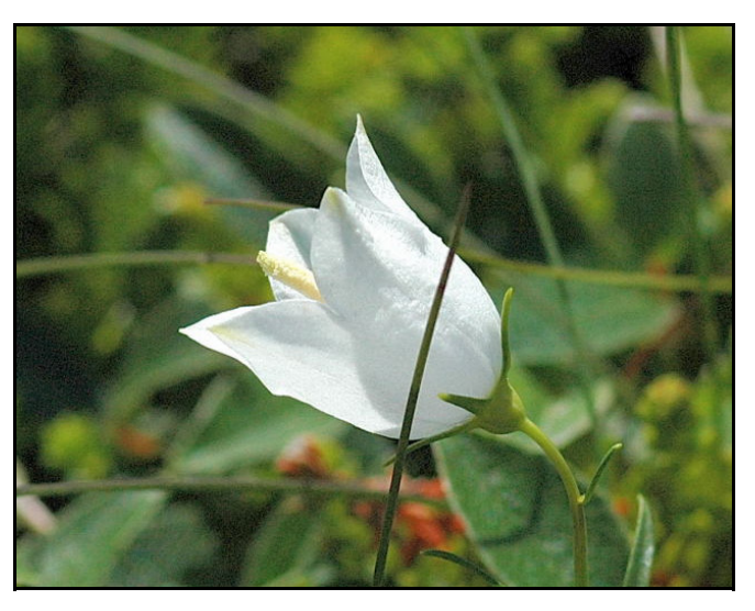
White form Campanula, Phillip's Garden Trail, Port au Choix

species were gone by. However, the group was still happy to see some of the rarer species in fruit. No sooner had we put our bags in our motel rooms on the first afternoon then Karl was whisking us off to a preview of the excitement to come—Corallorhiza maculata (summer coralroot) and C. striata (hooded coralroot) at the same site, the latter one of only two stations in all of Newfoundland. Just a few of the other species which we saw included Amerorchis rotundifolia (roundleaf orchid) (past), Calypso bulbosa (fairy slipper) (fruit), Cypripedium reginae (showy lady's slipper), Goodyera repens (lesser rattlesnake plantain) (in bud), Habenaria hookeri (Hooker's orchid) (past), H. obtusata (bluntleaved orchid), H. orbiculata (roundleaved orchid), Listera cordata (heartleaf twayblade), and Pseudorchis albida ssp. straminea (Newfoundland orchid).