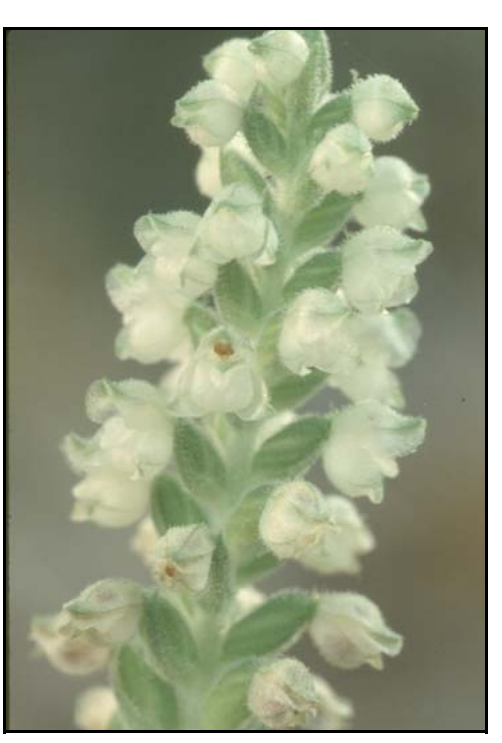
Goodyera pubescens (Downy rattlesnake plantain)

Farther down the road along the verges beside a wood we found two Platanthera cristata (crested fringed orchid) hiding within the woods margins. These orchids are very pretty and look like a smaller version of P. ciliaris with a hood. From the top looking down on the orchid, the symmetrical shape looked like a stairway with the spur acting as a bar. To compare them with P. pallida it would seem that these orchids were a lot smaller and more colorful than but not as orange as their cousins further south. We were hoping to find some hybrids that have been reported from the area,