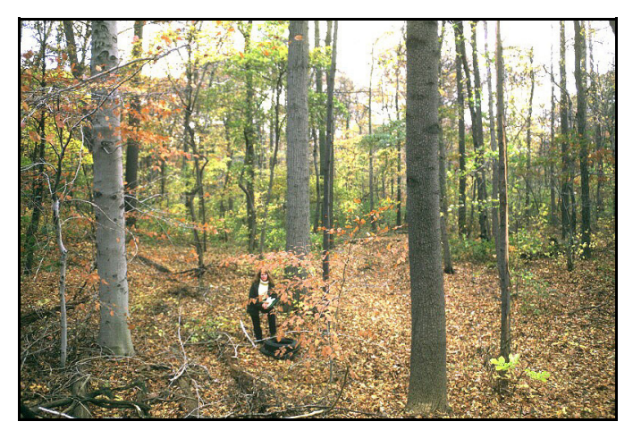
The interior of Grace Forest, Nassau County.

Perhaps the most important reason to protect the