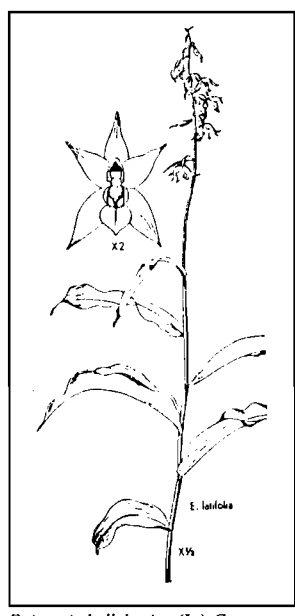
Epipactis helleborine (L.) Crantz